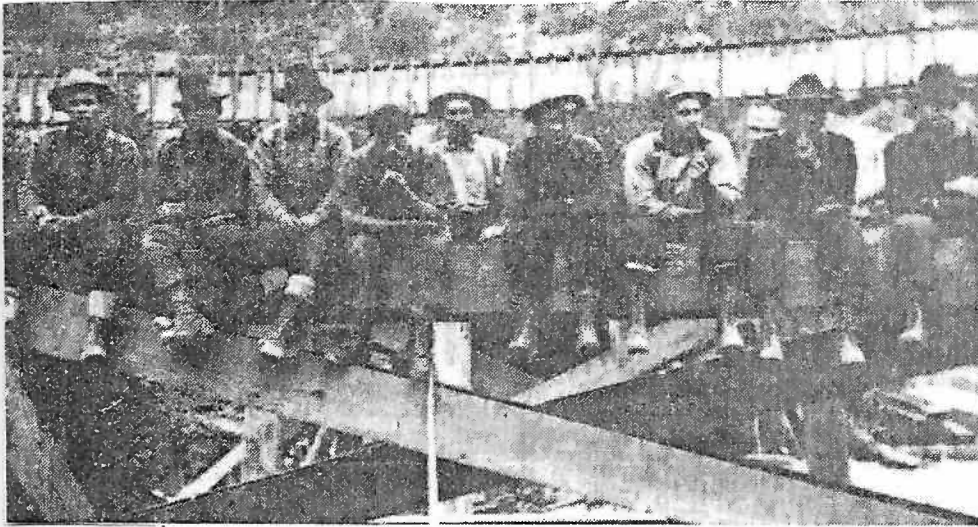
The original bridge building crew, 1910-20, as pictured in late local historian Verd Casselman's book "Ties to Water." It was recently replaced by a new acrow panel bridge.