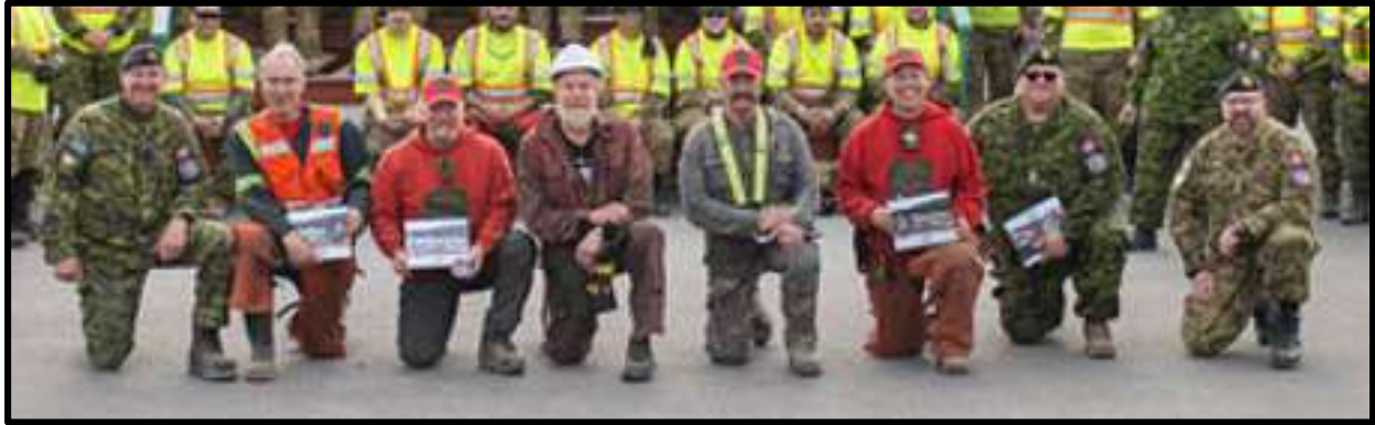
6 Canadian Rangers (1 CRPG) attended Ex FWS providing expert advice and training on subjects ranging from bear awareness to chainsaw maintenance.