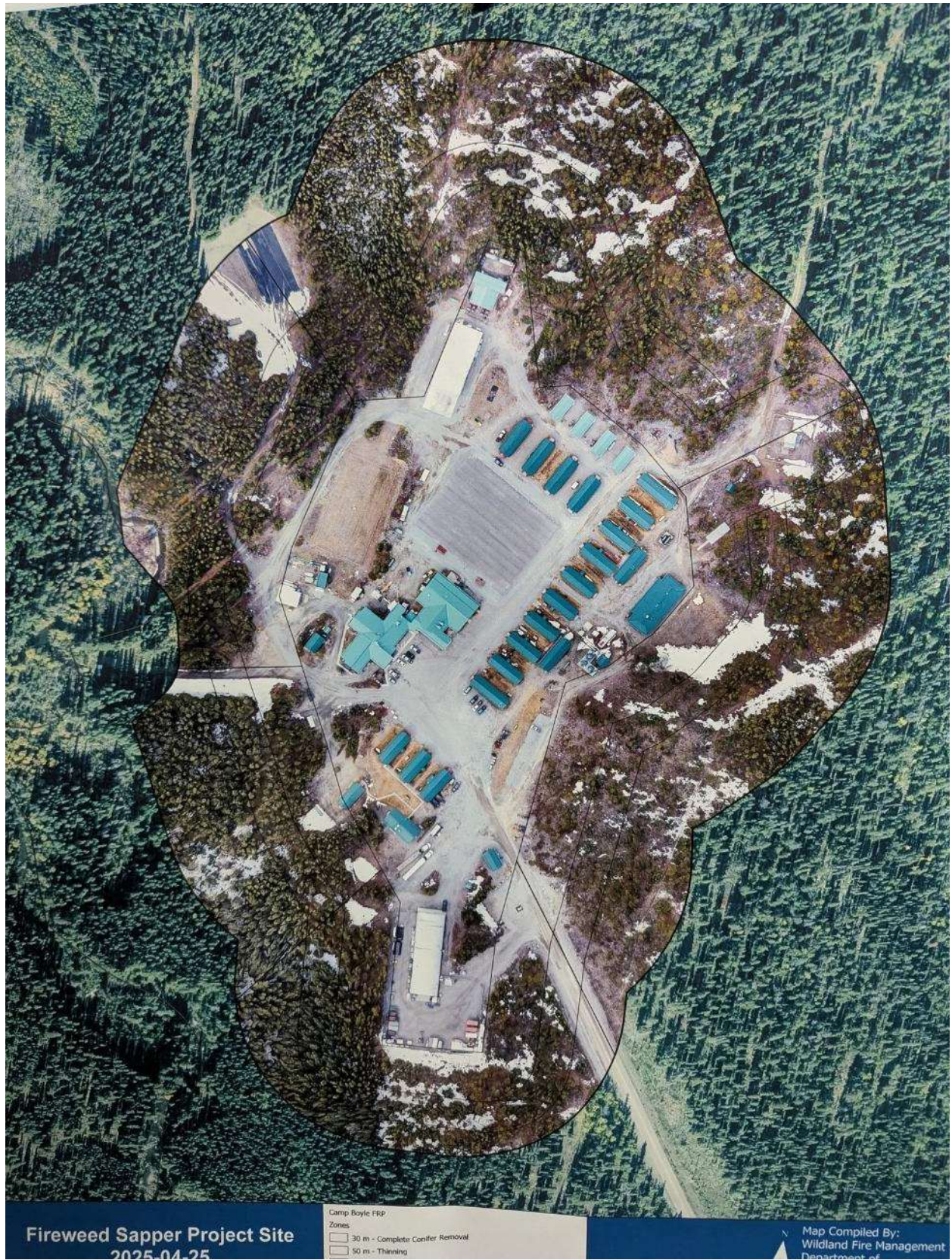
This is a before map of the camp taken by Milan Lapres from Yukon Wildfire.