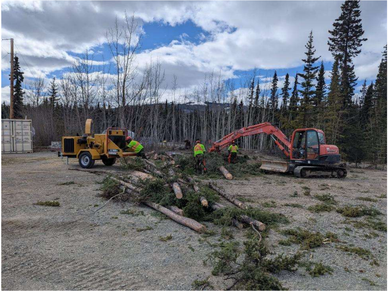
One of the other field sections. There were 5 field sections total in the squadron spread across the 2 troops.