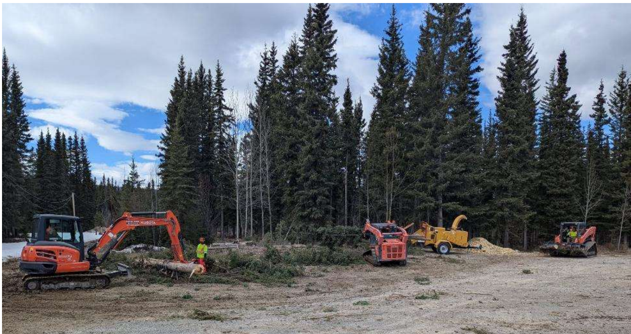
Here's the typical operation. The mini hoe on the right moves the trees out to where the skid steer can grab them. A Sapper limbs the tree and the log is set aside for a front end loader to pick up. More soldiers and sappers put the branches through the chipper.