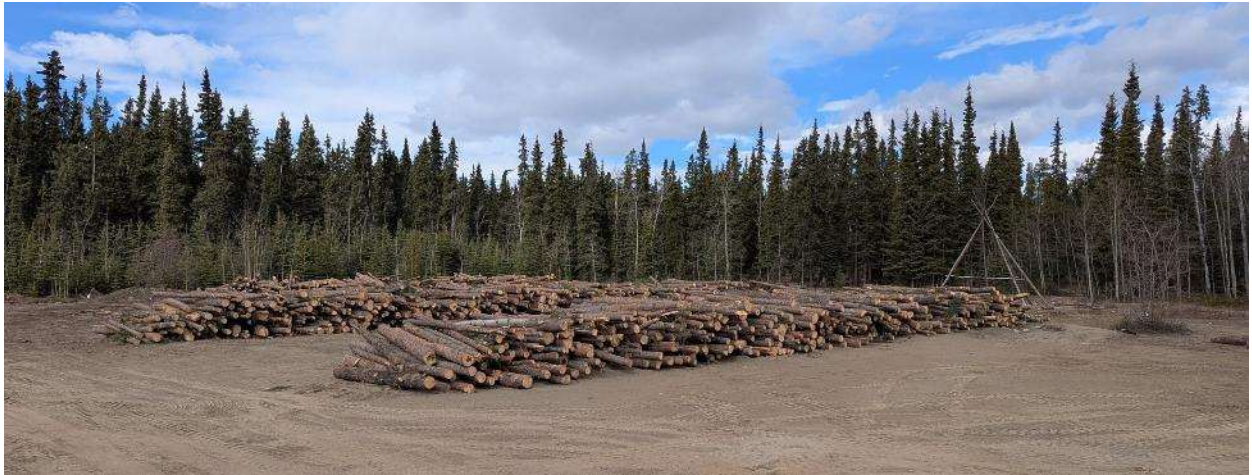
The log pile. This is about half of what we stockpiled. We estimate the team cut, bucked and cleared 2500 trees in 5 days!